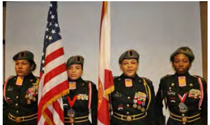
JROTC Color Guard